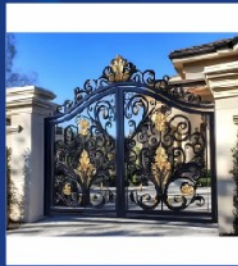
Main Grill Gate