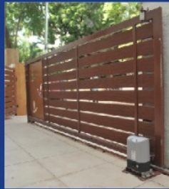
Remote Operated Gates