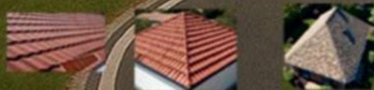
Stone Coated Tiles

Red Dot Blue Grey Terra Cotta Matt Black Coffee Brown