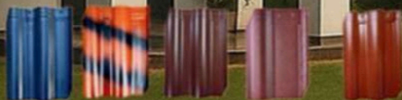
Elbano Ceramice Roof Tiles

Blue Grey Double Color Coffee Brown Red Dot Terra Cotta