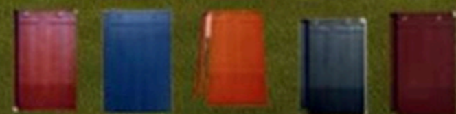
Flat Roof Tiles

Red Dot Blue Grey Terra Cotta Matt Black Coffee Brown